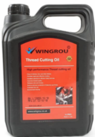
Wingrou Thread Cutting Oil