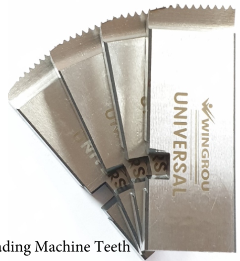
Wingrou Threading Machine Teeth