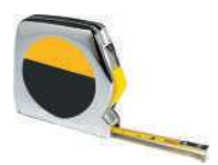
Fig. Diameter measuring tape